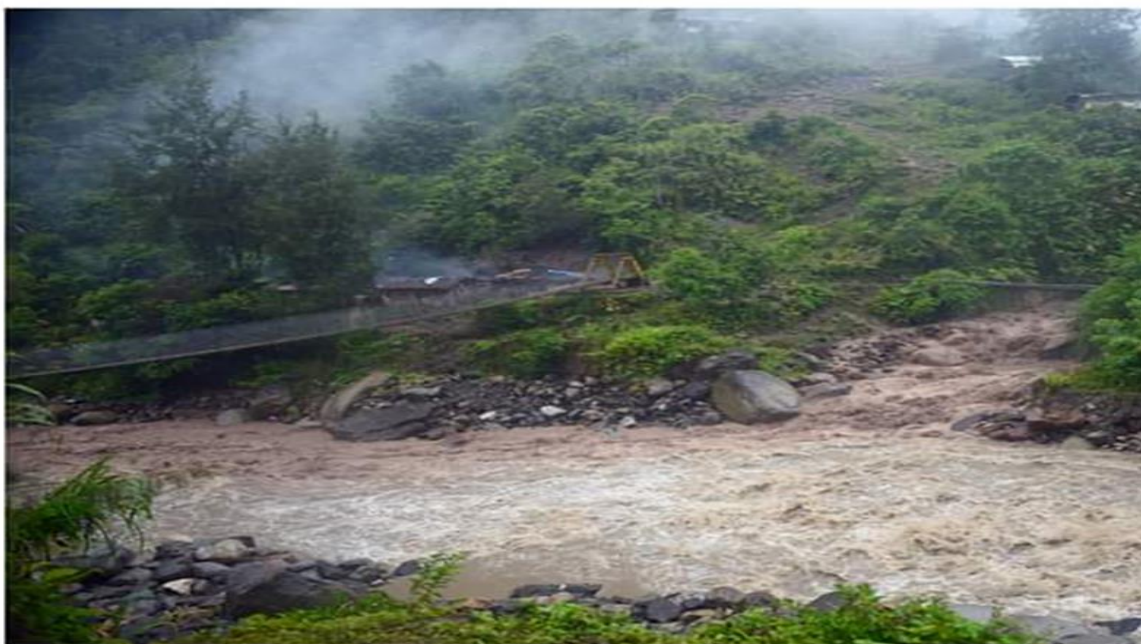
Fig 3: Ajikwa River near Banti Village around 20 kilometres from the Freeport mine.

The impact on the riverine ecosystem was generally contaminated from the headwaters down to the sea including vast areas of sago forests, fish stocks and biodiversity in it. The Ajikwa River was contaminated with tailings and sedimentation from the mine. Sedimentation build up along the river continue to expand outwards into the sago forests and also contaminated swamps and streams that were nearby. Vast areas of land were contaminated by the tailings.