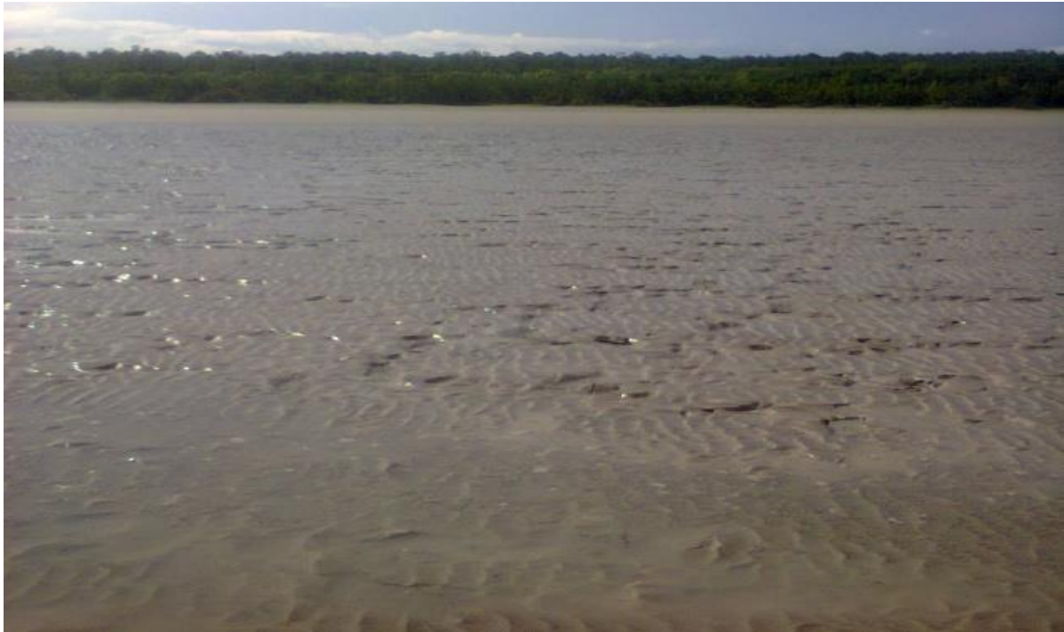
Fig 6: Sedimentation along the Ajikwa river to the south east of Timika town covering vast area of mangrove forests.