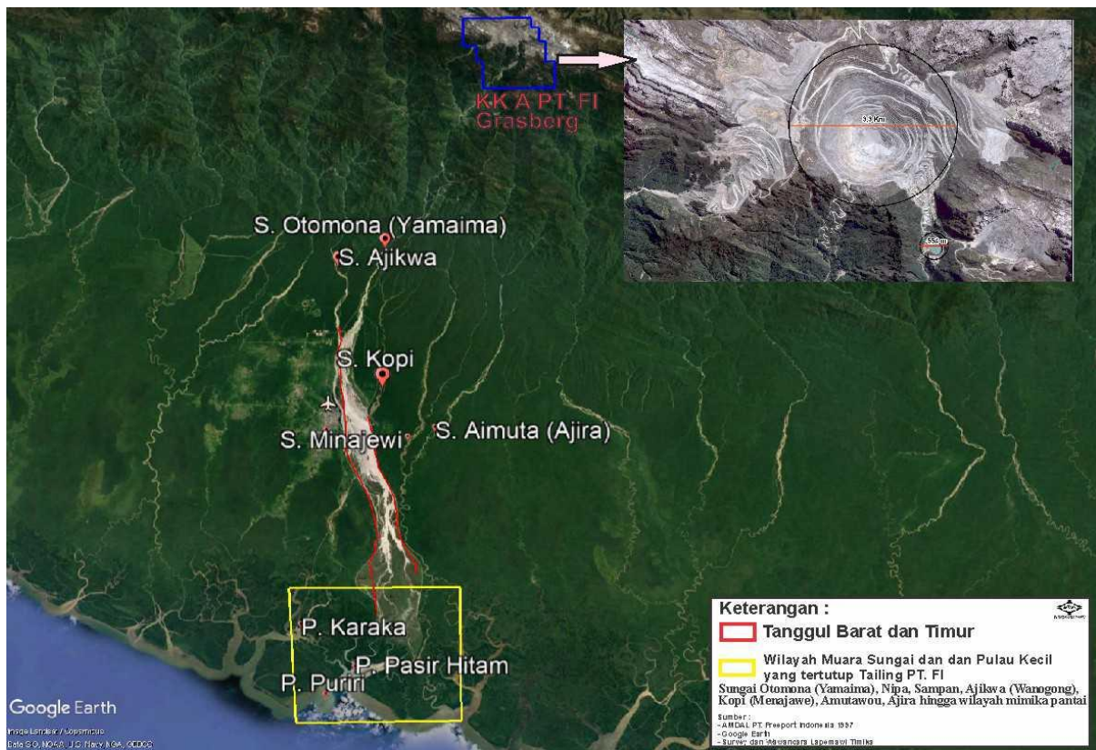
Fig 2: Map showing the Freeport Mine tailings dump site, red lines indicates Western and Eastern embankments of the tailing; Yellow Square indicates the disposal into the sea where the nearby islands were also affected by the tailings disposal.

Freeport Mine did not have tailing dump where the disposed tailings could be stored and treated before disposal into the river system. The Freeport Mine dump toxic wastes directly into the river in particular Ajikwa River that flows south-ward into the sea. In the process destroyed the nearby sago forests and fish in the rivers that our people depend on for survival for centuries.