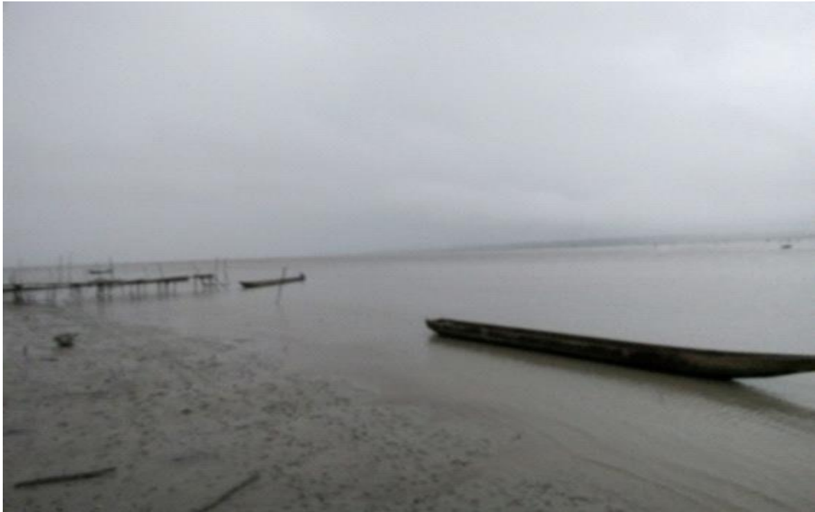
Fig 13: In 217 People on the black sand village abandoned the village due to pollution from the Freeport mine. The people from this village have not found a new resettlement site yet, they are currently living with relatives in Timika town and surrounding communities.