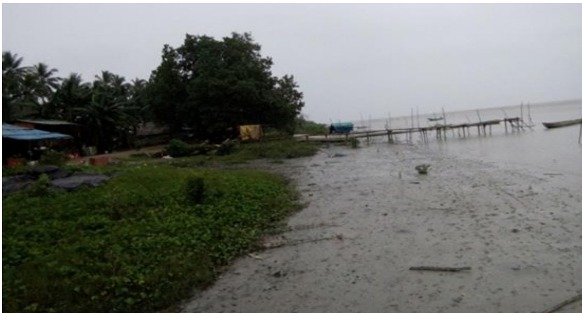
Fig 14: Black sand village before 2017 when the beach was not polluted to the extreme.