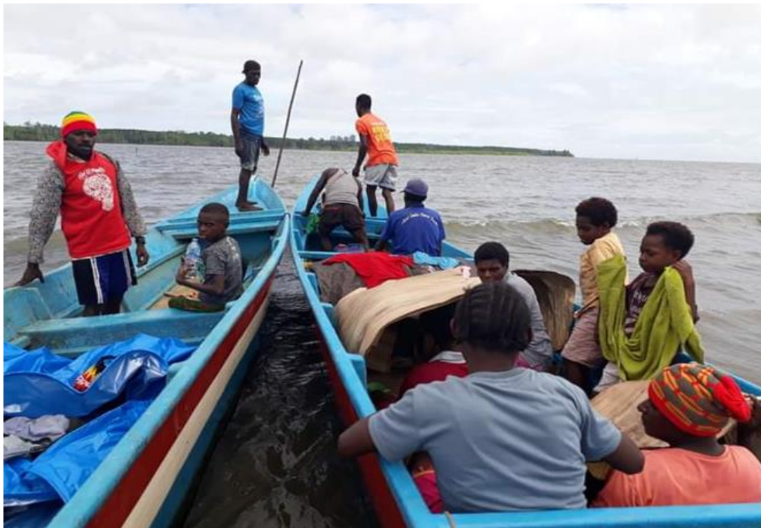
Fig 10: Villagers from Otakwa village travelling to Timika town experienced difficulties along Otakwa river in 2020 due to sedimentation build-up and shallow water making it difficult for the canoes to use motors, they have to use support sticks.

Their only means of transport is by dug out traditional boats. The traditional dug out boats are also used for inter-island communication, recreation for burial, perform traditional rituals on boats in rivers, trading and barter, looking for and collecting food in the sea or rivers and visiting relatives from one village to another. All these activities were lost with the river pollution and sedimentation. The Kamoro and Sempan tribes who live along the river and nearby islands are on the verge of extinction.