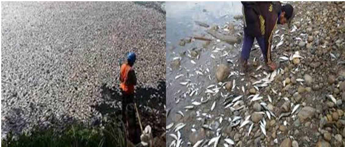
Fig 8: Millions of fish died in Timika on the waters of Ajikwa down to the sea where the river meets the sea. Freeport explained that it was a natural phenomenon, fish that were died were not from the river but from the sea migrated to the area to look for food, died due to low oxygen.

has occurred 4 times yearly from 2016-2020. People still see fish die every day on the river banks.