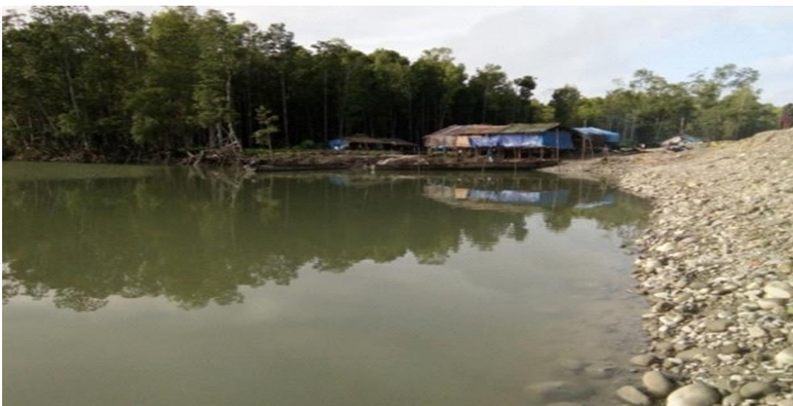
Fig 20: Freeport construct walls like this to block off polluted water from spreading into fresh water systems in the areas along the Ajikwa river.

Freeport had promised in April 2014 to go down to the villages to meet with the victims in 3 districts but this did not come through. The company only built an alternative sea route through a dried river but route cannot be used because the river is shallow.