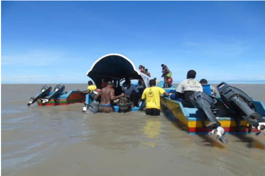
Fig 11: In 2019 the group headed for Otikut village, Manasasri district was constrained by waste from the river mouth between Puriri Island and the sea.