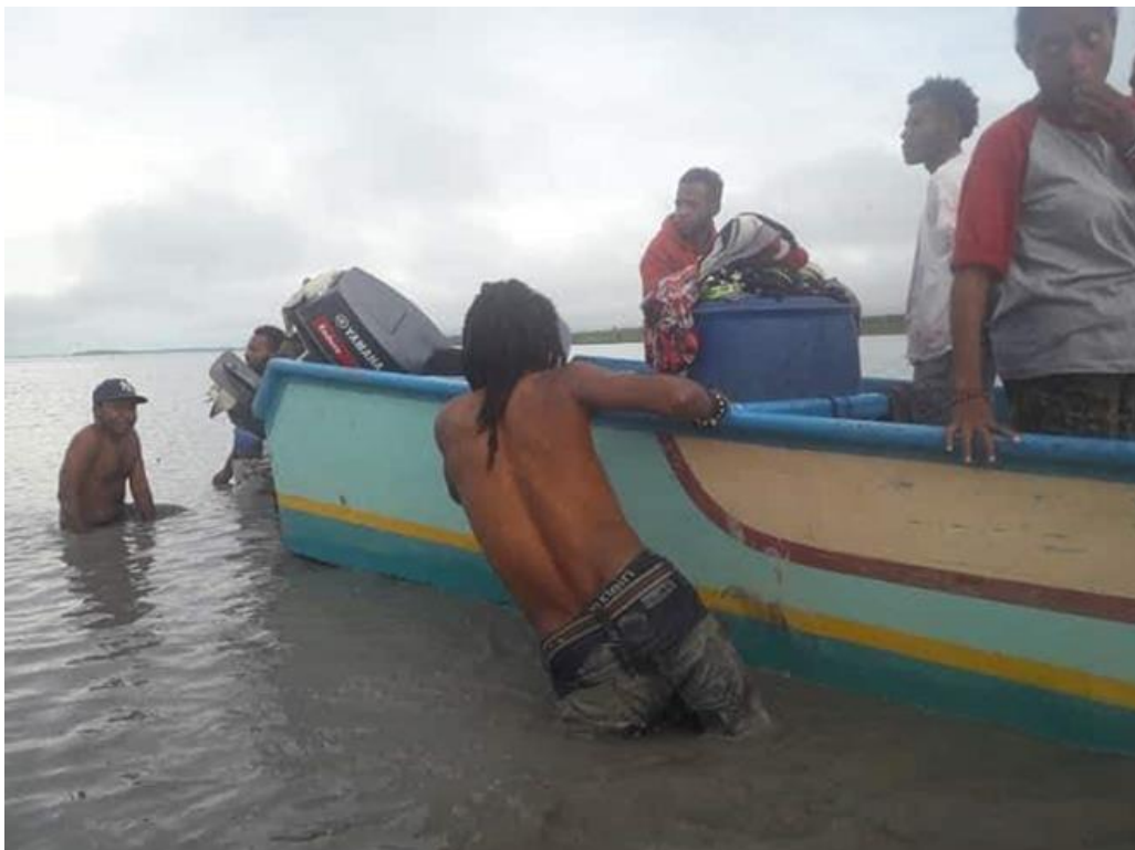
Fig 12: People who want to go to Agimuga village in 2018 got stuck between the Sampa River and Puriri Island near the sea