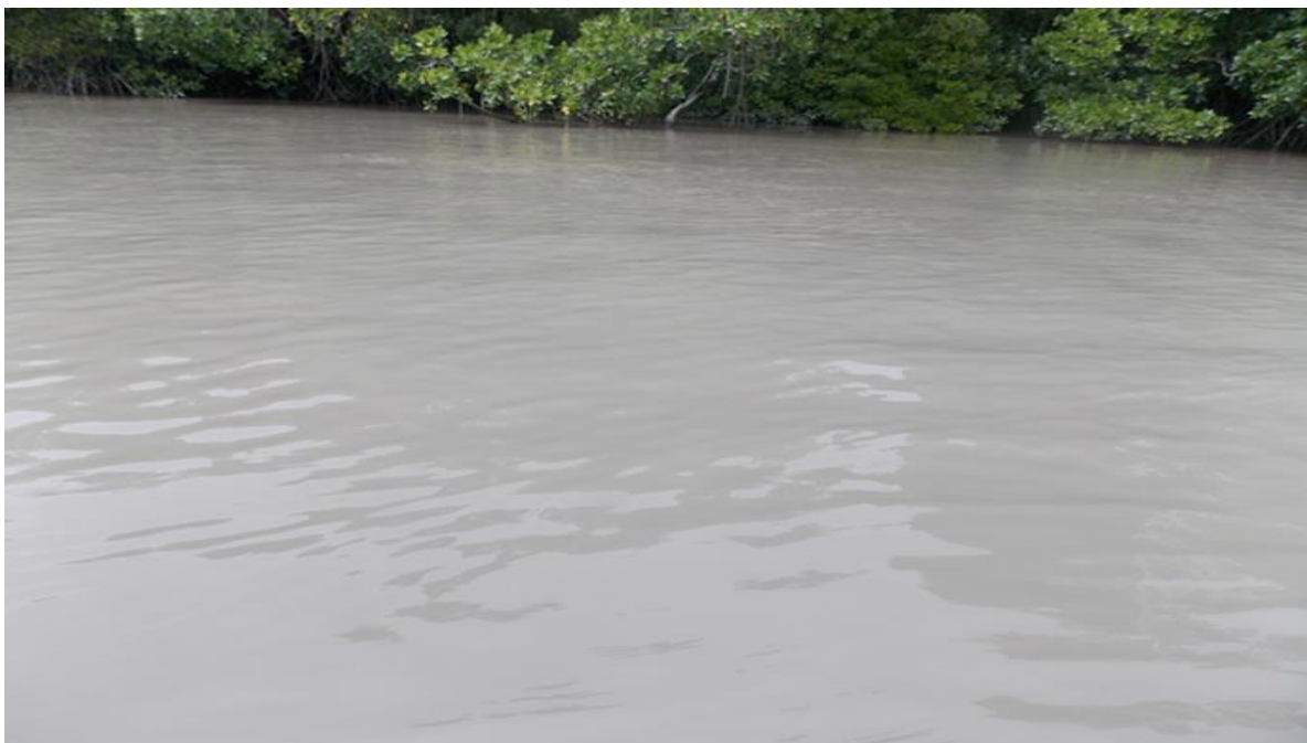
Fig 7: Polluted Ajikwa river near the sea.

Impact on plants on the banks of Ajikwa River is getting worse by the day due to constant sedimentation. Trees dry up including sago plants and mangroves along the coastal regions and on the nearby islands. The water change to a cloudy green-black colour, even during floods, the colour becomes coffee milk and black sulphur. Millions of fish died suddenly in the area of the eastern embankment where the Freeport tailings waste disposal was located it