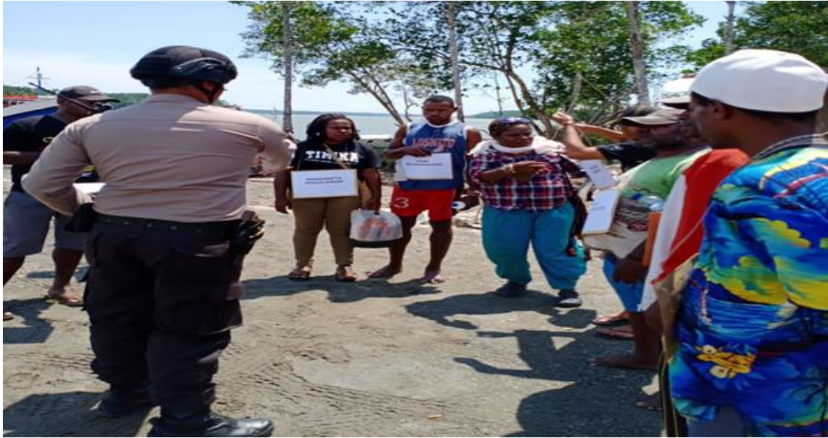
Fig 22: CSOs doing awareness to the surrounding communities on the pollution and health issues affecting the communities. They were also visited by the police and the surrounding communities.