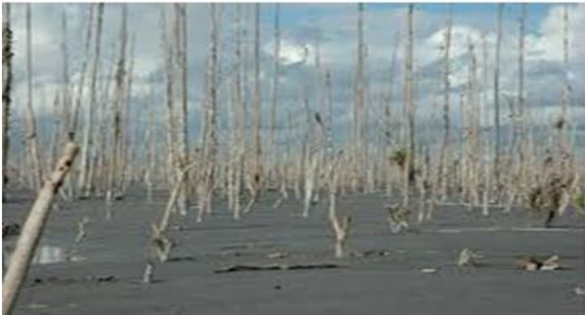
Fig 5: Ajikwa River near the sea, the impacts of the toxic waste and sedimentation on the Mangroves near the sea.