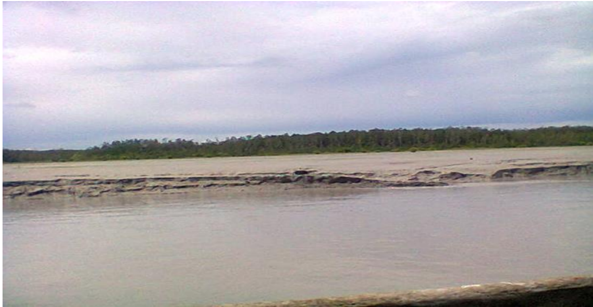
Fig 4: Ajikwa River in the middle, 50 kilometres from the sea and 60 kilometres from the mine, sedimentation build up could be clearly seen, it stretches for some kilometres into the forests.