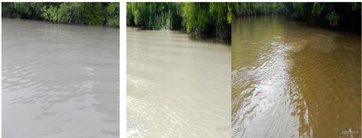
Fig 9: Common water colours on the south eastern waters of Timika where the toxic waste are being dumped.