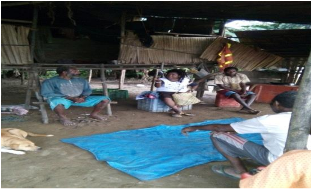
Fig 15: Villagers living in low quality homes due to the problems, the displaced villagers from Black sand village construct makeshift homes like this as well to survive.