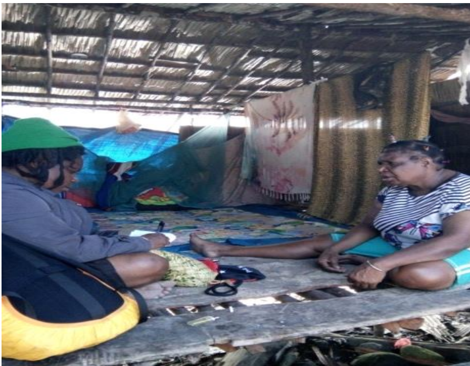
Fig 16: Abandoned villagers from Black sand village still not settled since 2017.